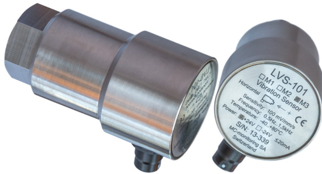
LVS-101 M3 model